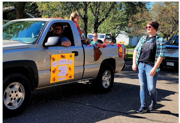
FALL FESTIVAL PARADE