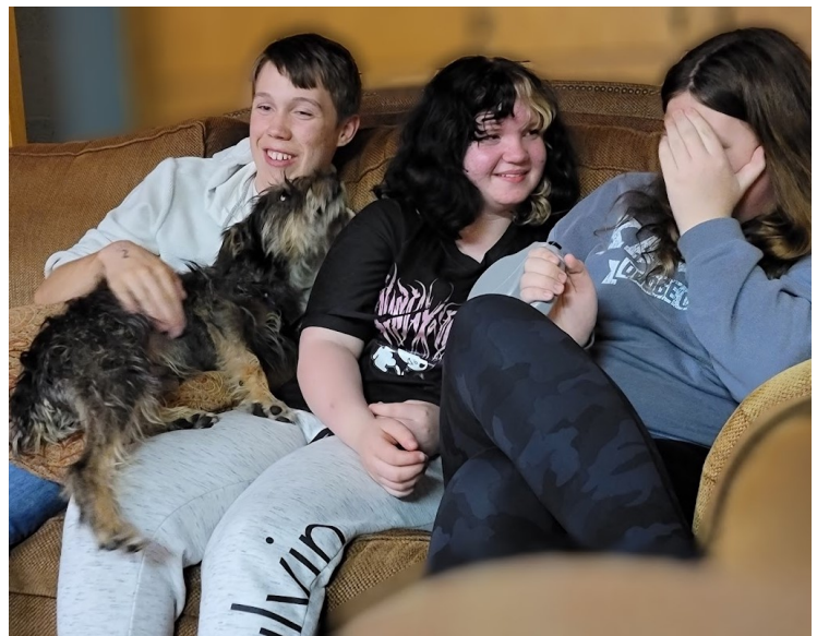
The kids enjoyed a special guest at Wednesday Youth Group.