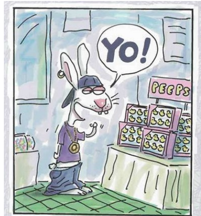
The Easter Bunny at the candy store, giving a shout out to his Peeps.

As you start your spring cleaning, please remember to set aside your unwanted items for our upcoming rummage sale on Saturday, May 25th from 8 am to 3 pm. Donations will be accepted the week of May 19-24. Thank you!